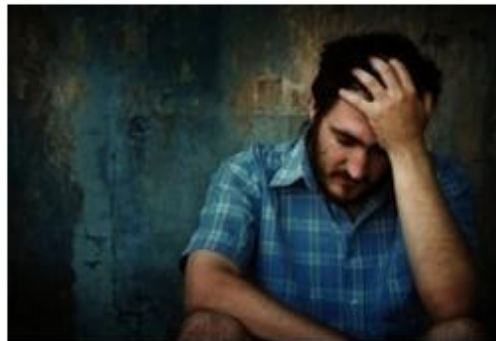
Defaulting on student loans has negative consequences.

It's no secret that many borrowers are struggling to pay off their student loans. In the past, the Student Loan Ranger has discussed rising default rates.