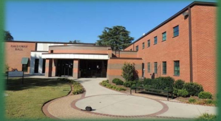
Galloway Hall Classrooms