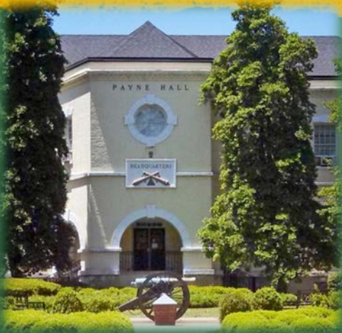
Payne Hall Administrative Offices and ACE