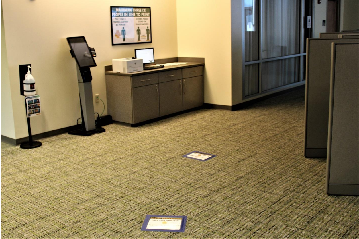
When lines are necessary, we will all be reminded to stay at least 6 feet apart.