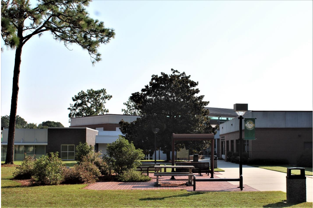
The new addition to the JAM is complete.