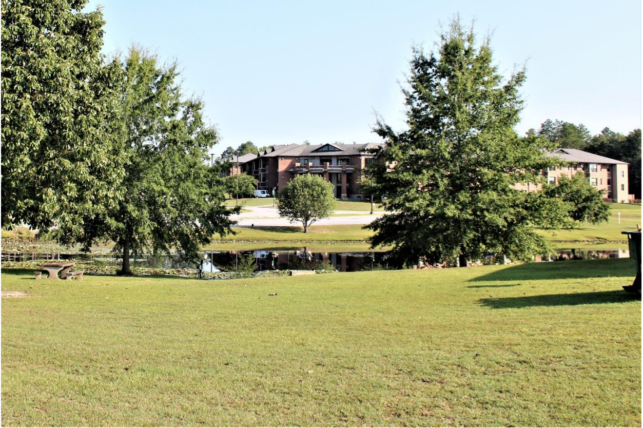
Bobcat Villas are just across the pond and are once again filled with students.