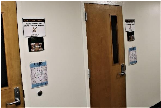
Seating in classrooms is carefully spaced for safety,