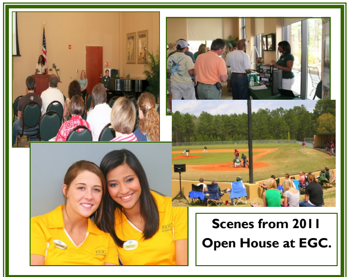
Scenes from 2011 Open House at EGC.