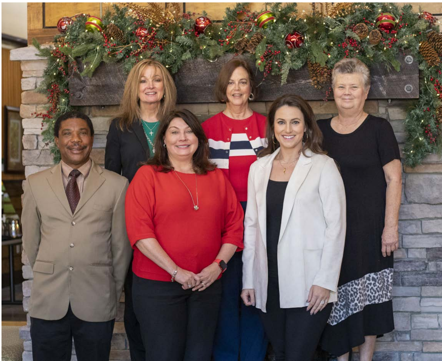
Fulford Center Advisory Board Members present at December Meeting.

We hope you had a wonderful holiday season and look forward to serving you in 2022!