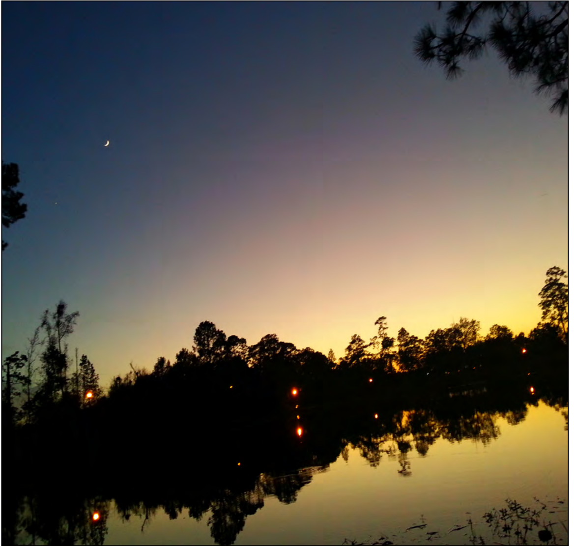
Industrial Sunset - Curtis Clemons