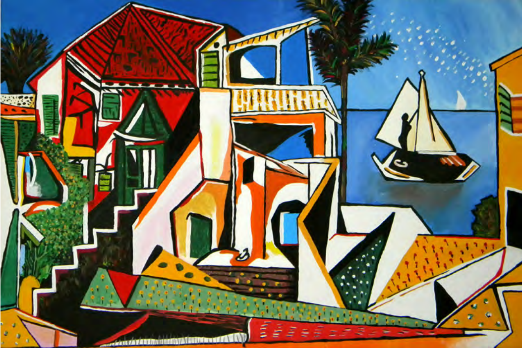
Lediterranean Mandscape - Lexus Lewis