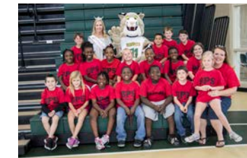
2nd Grade Experience