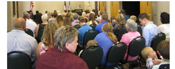
DAR Student Recognition