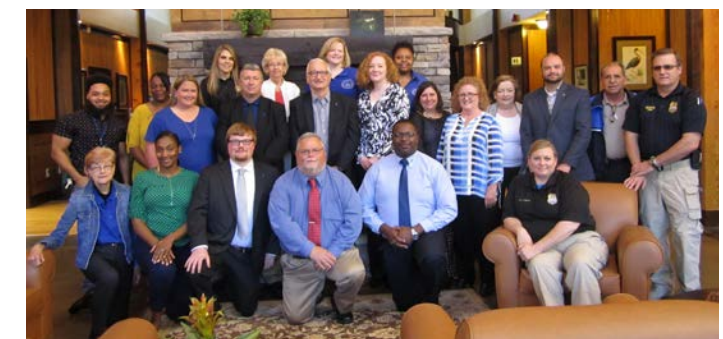
Sunshine House Appreciation Breakfast