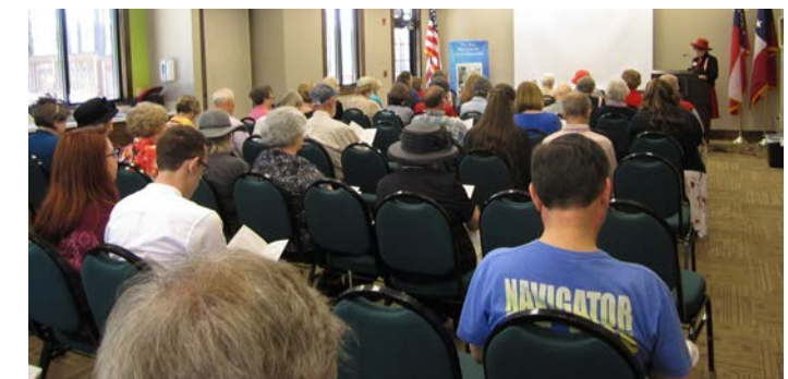
United Daughters of the Confederacy