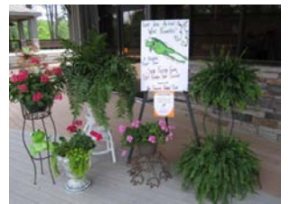
Pine Tree Flower Show