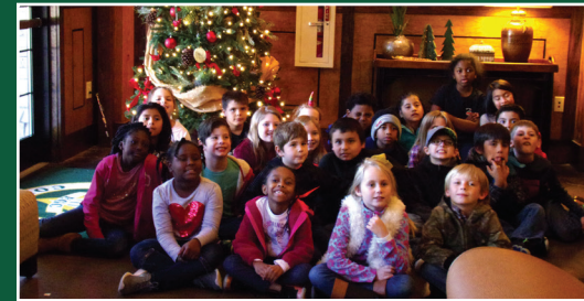
Metter Elem 2nd Grade Visit