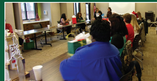
GA Vocational Rehab Mtg