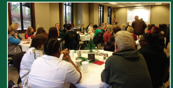
Business Affairs Training/Luncheon