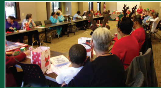
Emanuel County Schools Nutrition Mtg