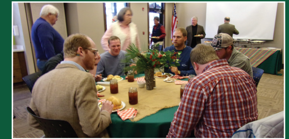
Gilmer Groomsmen Luncheon