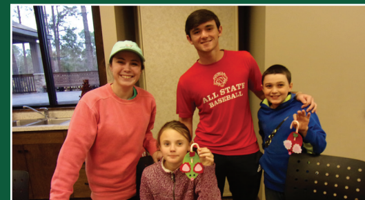
Bobcat Buddies Final Fall Session