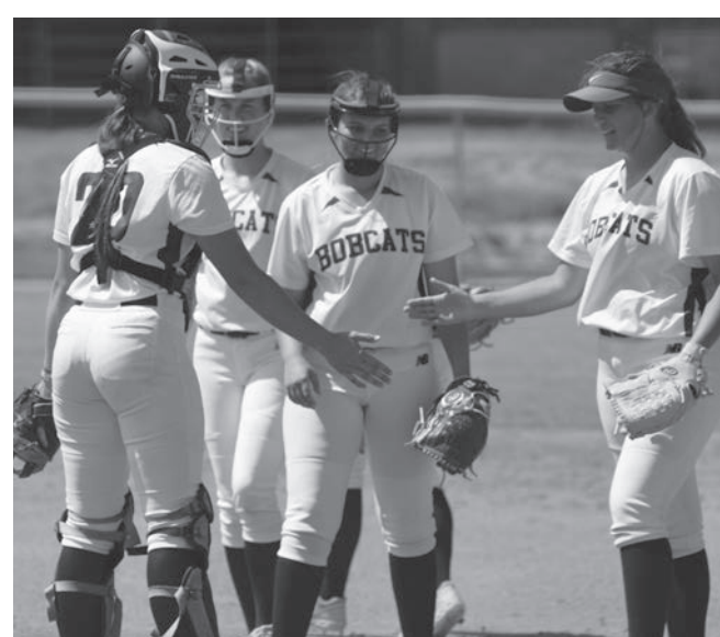
LADY BOBCATS IN ACTION

For more information about athletics at EGSC, visit www.ega.edu/athletics .