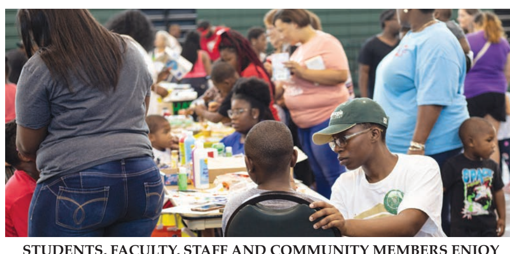
STUDENTS, FACULTY, STAFF AND COMMUNITY MEMBERS ENJOY THE FAMILY & FRIENDS FUN DAY ACTIVITIES