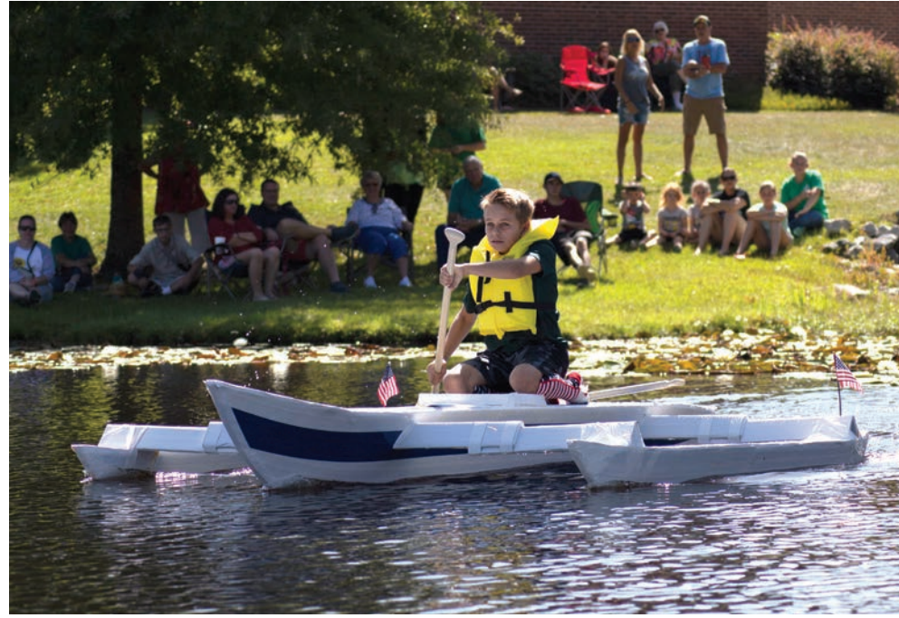
THE WINNING BOAT IN THE DUCT TAPE REGATTA, USS GA 1842 TRAIL LIFE'S "SWORD OF THE SPIRIT"