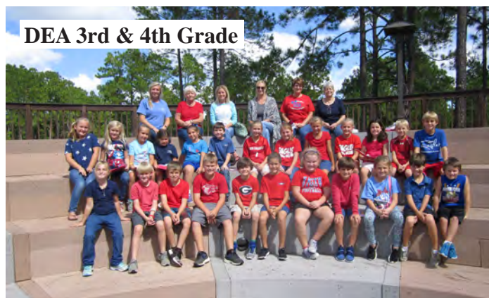
DEA 3rd & 4th Grade