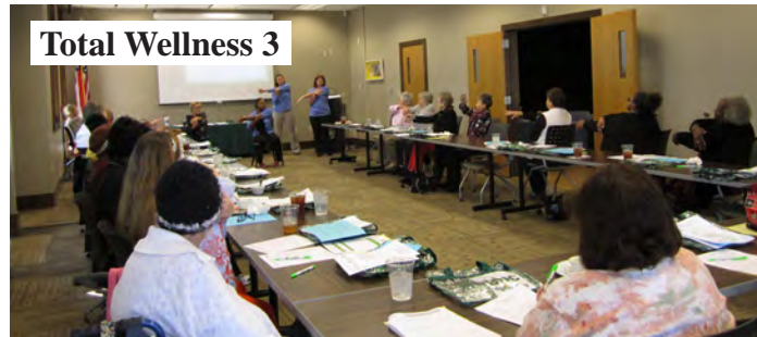
Total Wellness 3