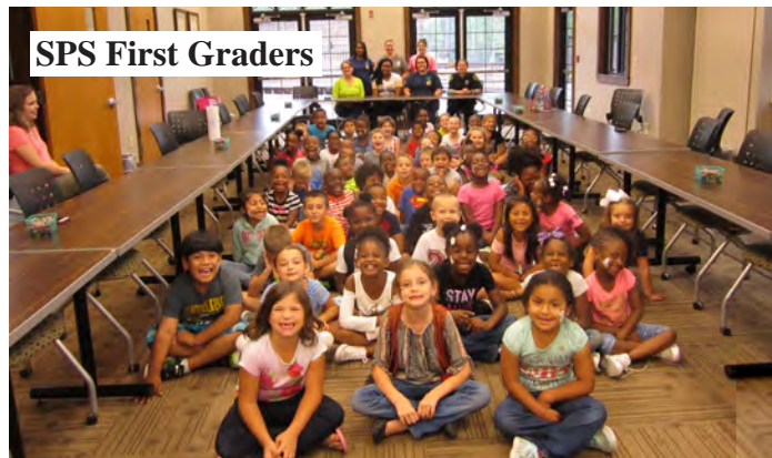
SPS First Graders