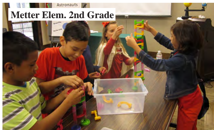
Metter Elem. 2nd Grade