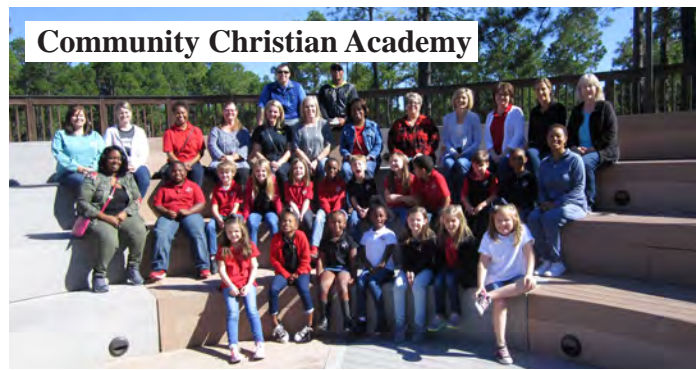
Community Christian Academy