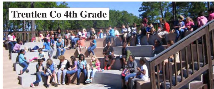
Treutlen Co 4th Grade