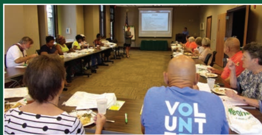
Total Wellness 3