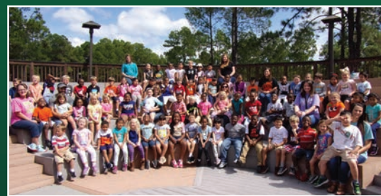
SPS First Grade