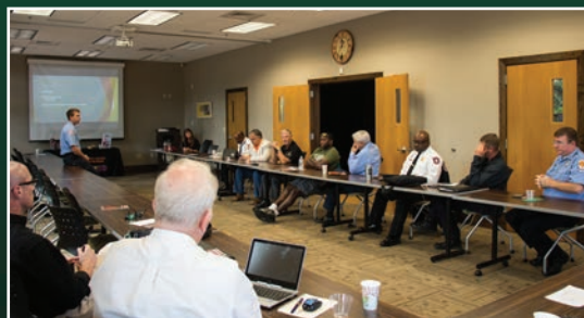
FESA Advisory Council