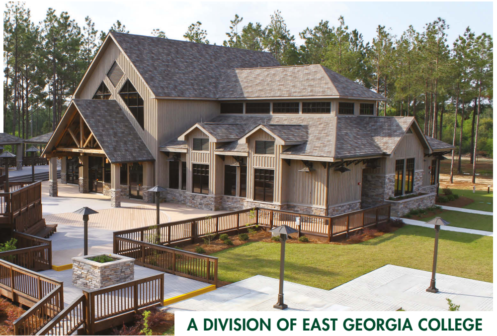
A DIVISION OF EAST GEORGIA COLLEGE